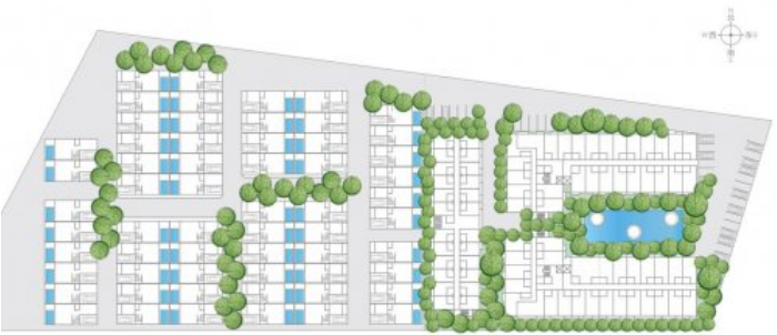
UTN 2期 总体规划图 MASTER PLAN