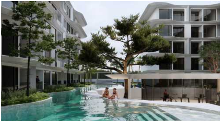
PERSPECTIVE | BELLEVUE BEACHFRONT