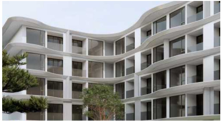
PERSPECTIVE | BELLEVUE BEACHFRONT