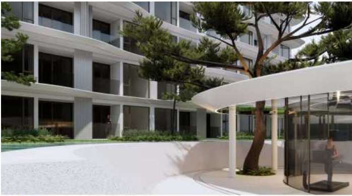
PERSPECTIVE | BELLEVUE BEACHFRONT