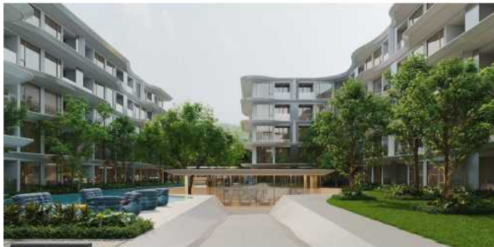
PERSPECTIVE | BELLEVUE BEACHFRONT