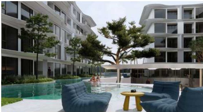
PERSPECTIVE | BELLEVUE BEACHFRONT