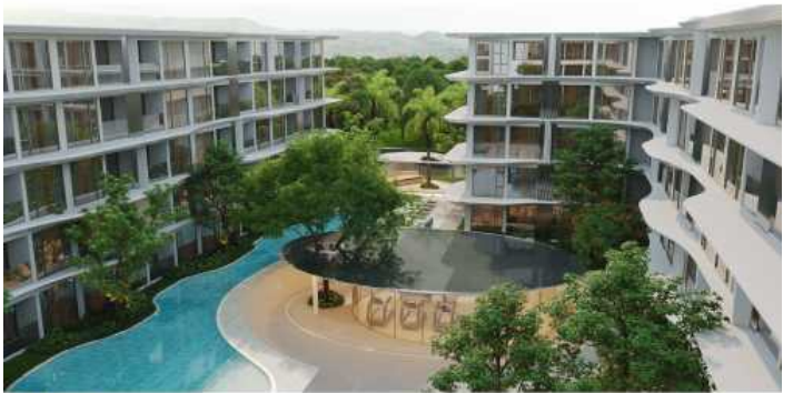
PERSPECTIVE | BELLEVUE BEACHFRONT