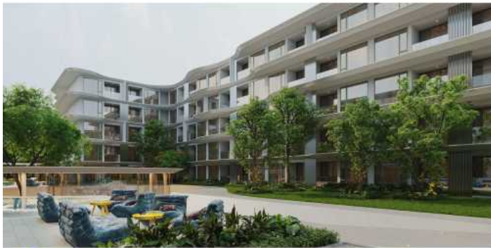
PERSPECTIVE | BELLEVUE BEACHFRONT